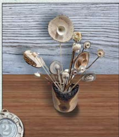
Silver Medal to Morag Clark