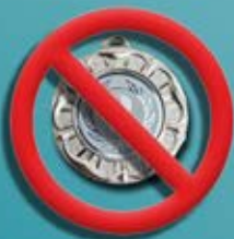
Nothing entered for Silver