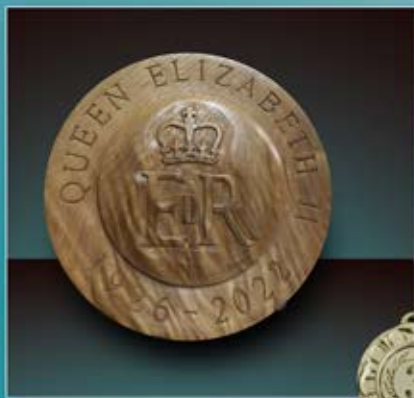
Bronze Medal to Cedric Boynes