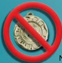
Nothing entered for Bronze