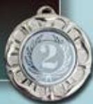
Silver Medal to Pete Stubbs