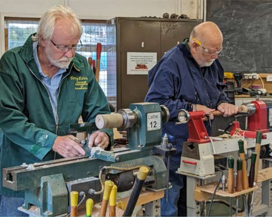
Working two lathes, we were treated to an array of different ideas for decorations.