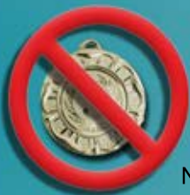
Nothing entered for Bronze