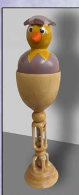
Gold Medal to Cedric Boyns