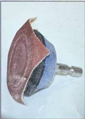
Sanding arbor for a drill

Have the lathe running at around 500rpm for a small bowl with the drill running at full speed. Go through all the grades as normal.