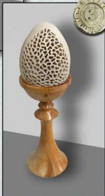
Bronze Medal to Nick Dodge