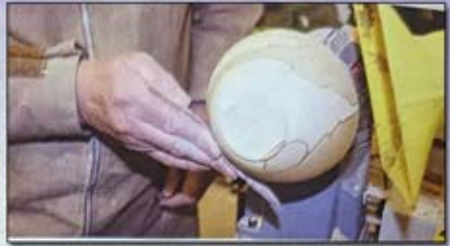
Using a dust extractor