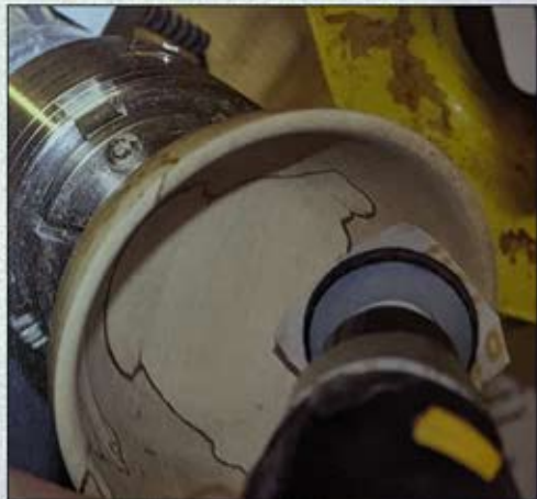
Sanding the inside of a bowl