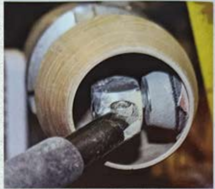
Sanding inside a vase