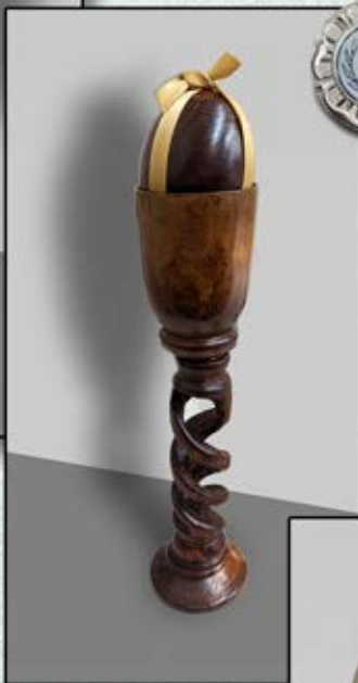
Silver Medal to Pete Stubbs