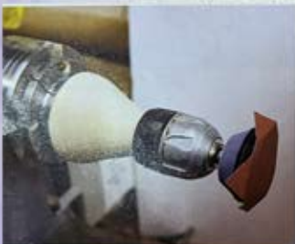
Drill chuck with an arbor