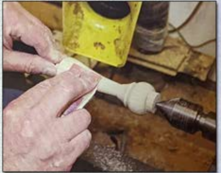
Sanding with the grain