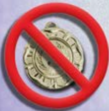
Nothing entered for Bronze