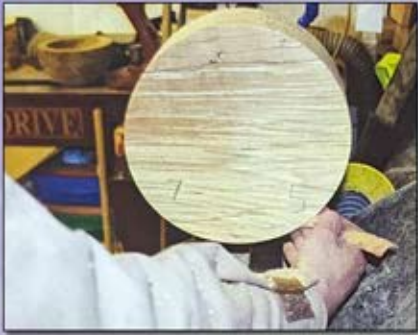
Positions for sanding