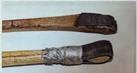
Home-made sanding jigs

This is ideal for sanding edges of ferns or shaping components.