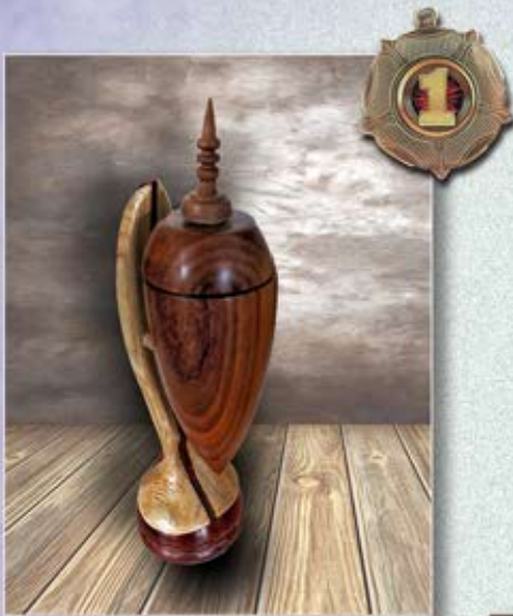
Gold Medal to Pete Stubbs