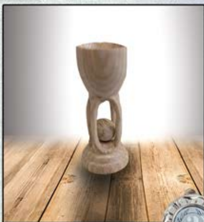
Silver Medal to Cedric Boyns