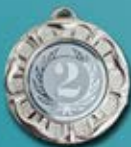
Nothing entered for silver