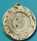
Nothing entered for bronze