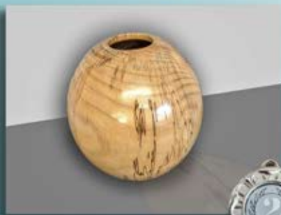
Silver to Nick Dodge