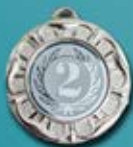
Nothing entered for silver