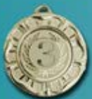
Nothing entered for bronze